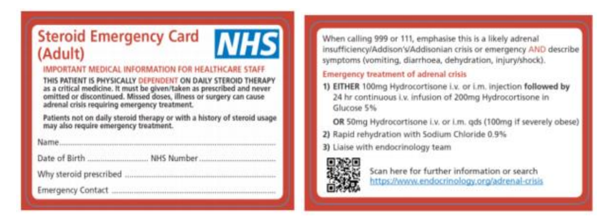
Figure 1: Steroid Emergency Card

The blue Steroid Treatment Card (figure 2) and the London Respiratory Network Card (<a href="https://www.networks.nhs.uk/nhs-networks/london-lungs/documents/high-dose-inhaled-corticosteroid-alert-card-order-form">https://www.networks.nhs.uk/nhs-networks/london-lungs/documents/high-dose-inhaled-corticosteroid-alert-card-order-form</a>) are unaffected by the introduction of the NHS Steroid Emergency Card (figure 1). Patients should keep these, if advised by their healthcare team whilst implementation of the new Steroid Emergency Card takes place. Patients being prescribed steroids outside the scope of this alert, would still be eligible for the blue standard Steroid Treatment Card. The blue Steroid Treatment Card gives patients guidance on minimising the risks when taking steroids and also provides details of the prescriber, drug, dosage and duration of treatment.